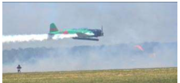
A replica of the A26M Zero.