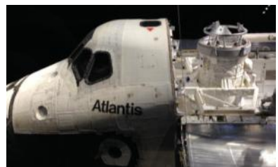
Figure 6. Atlantis at the Kennedy Space Center.