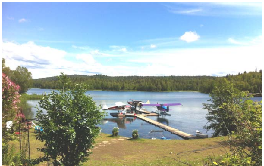
Christianson Lake at Talkeetna. According to Jerry, it's a base for float planes, especially those flying to Denali national Park..